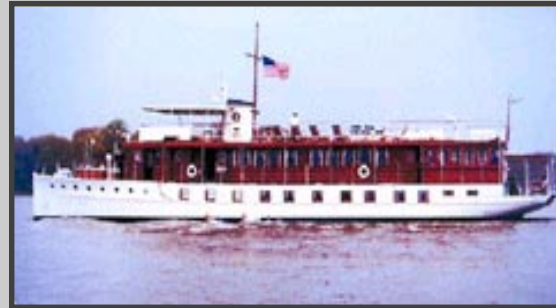
The Presidential Yacht U.S.S. Sequoia

For more information about the Sequoia, please visit www.sequoiayacht.com .