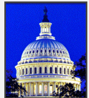
The Capitol Building