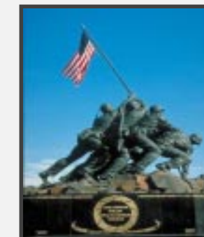
The Marine Corps War Memorial

Be sure to register and take the family on a guided evening tour aboard a covered trolley. You will enjoy the sights and sounds of this truly magnificent city as you ride with a professional guide for an entertaining and historically informative tour. The trolley will depart the Law Center promptly at 8:00 PM on Friday, October 20. Be sure to bring a camera!