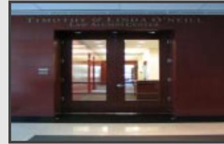
Entry way to the Timothy and Linda O'Neill Law Alumni Center

The faculty members at the Law Center invite you to stop by the Alumni Welcome Center so that they may greet and welcome you back to the law school. The Alumni Welcome Center is located in the Eric E. Hotung International Law Center Building and was designed with you in mind. Light refreshments will be served.