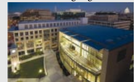
Hotung International Law Center Building & Sport and Fitness Building at night.