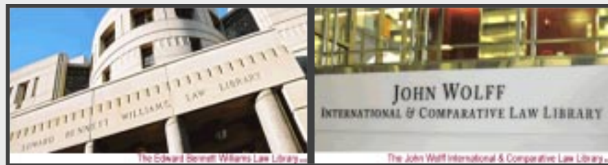
The Edward Bennett Williams & John Wolff International and Comparative Law Libraries

On Friday, October 20, 2006, come tour the Edward Bennett Williams Law Library and learn about the innovative methods of legal research from its resource librarians and visit the new space for our Journals. The tour will end with a book signing by a prominent Law Center author and a reception in the John Wolff library. Make sure you plan to be a part of this rewarding event.