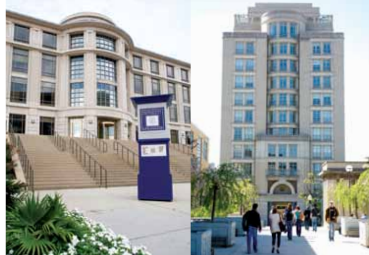
Bernard P. McDonough Hall