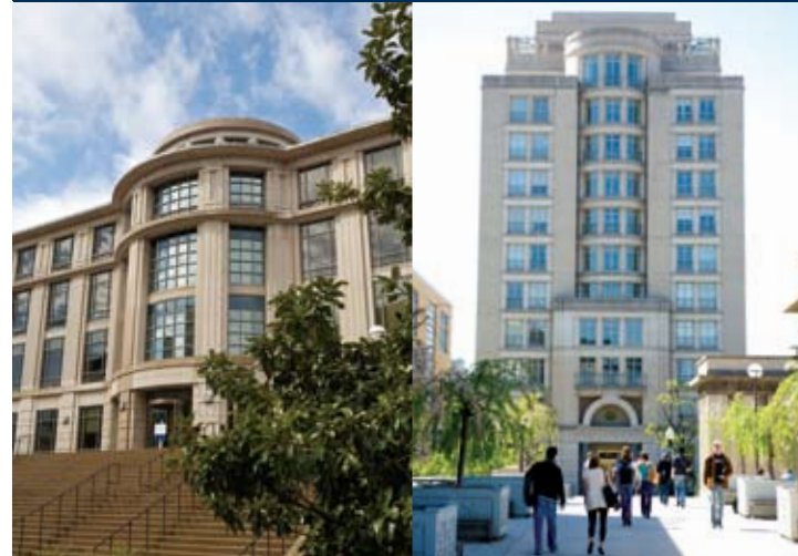
Bernard P. McDonough Hall