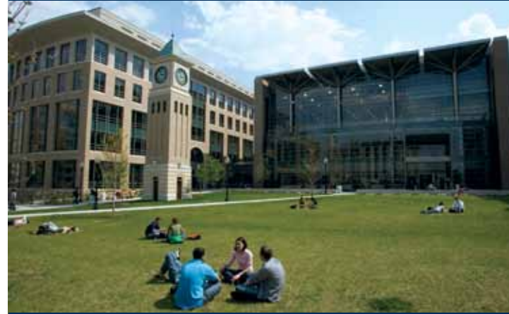
Eric E. Hotung International Law Building (left), Tower Green and Sport & Fitness Center