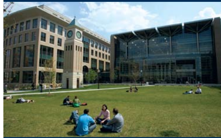
Eric E. Hotung International Law Building (left), Tower Green and Sport & Fitness Center