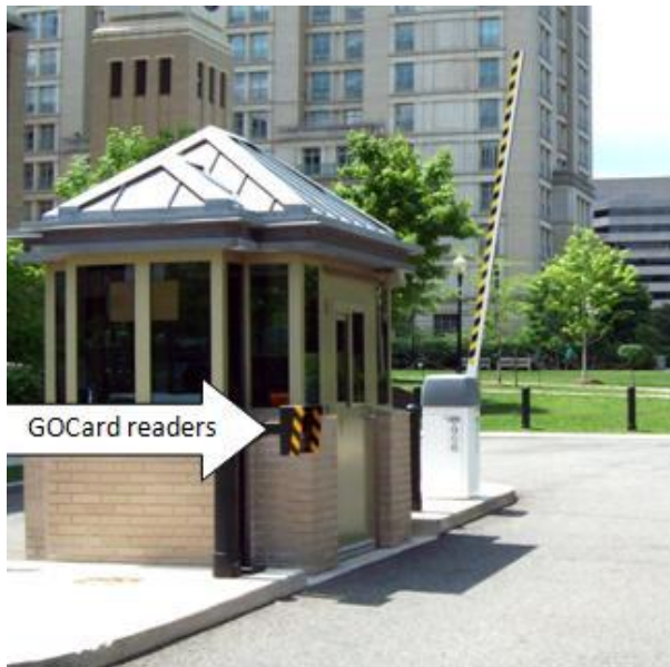
All customers who park in the McDonough Hall garage will need to swipe their GOCard on one of the new GOCard readers in order to enter the garage.

If you arrive after 6:00 p.m. or on a weekend or holiday, you do not need to swipe your GOCard at the card reader next to the parking booth. The gate will be open. Please proceed to the second card reader that is located on the ramp to the garage. You must swipe your GOCard at this card reader in order for the garage door to open. (When the garage door is open, you do not need to swipe your card at this second card reader.) Parking after 6:00 p.m. or on a weekend or holiday is free of charge.