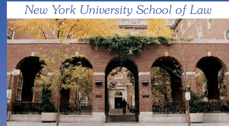
New York University School of Law