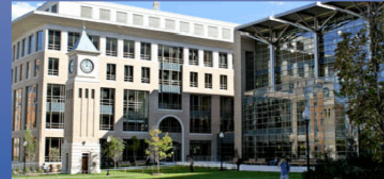
Georgetown University Law Center