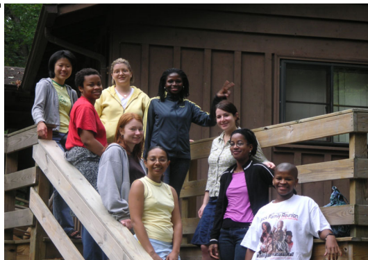
New Fellows on Retreat in West Virginia