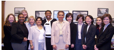
Congresswoman Norton with Fellows