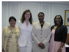
Senior LAWA Panel

The senior LAWAs presented their graduate papers on women's rights in southern Africa to a packed audience at the Georgetown University Law Center in August.