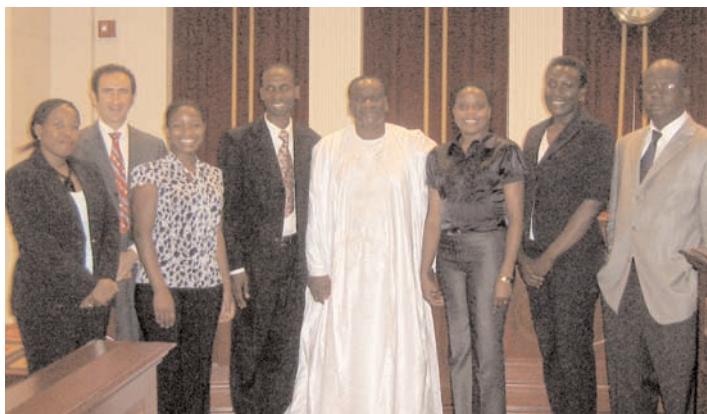
LAWAs with African Court of Human Rights Judges

The Women’s Forum at Covington & Burling invited the LAWA Fellows to speak about women’s human rights in their