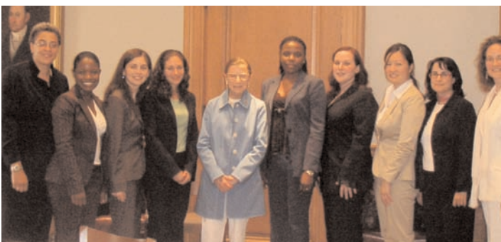
Fellows with U.S. Supreme Court Justice Ruth Bader Ginsburg