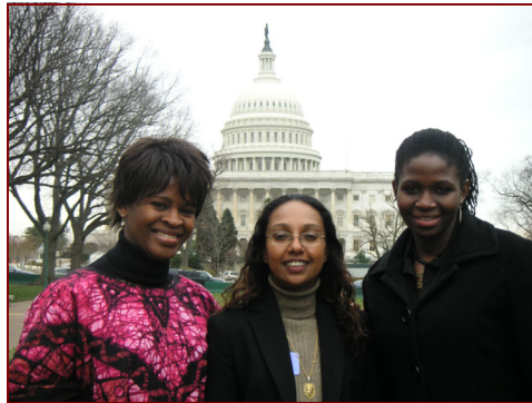
LAWA Congressional Briefing