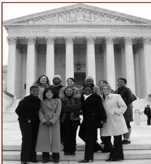
Fellows on the Steps of the Supreme Court