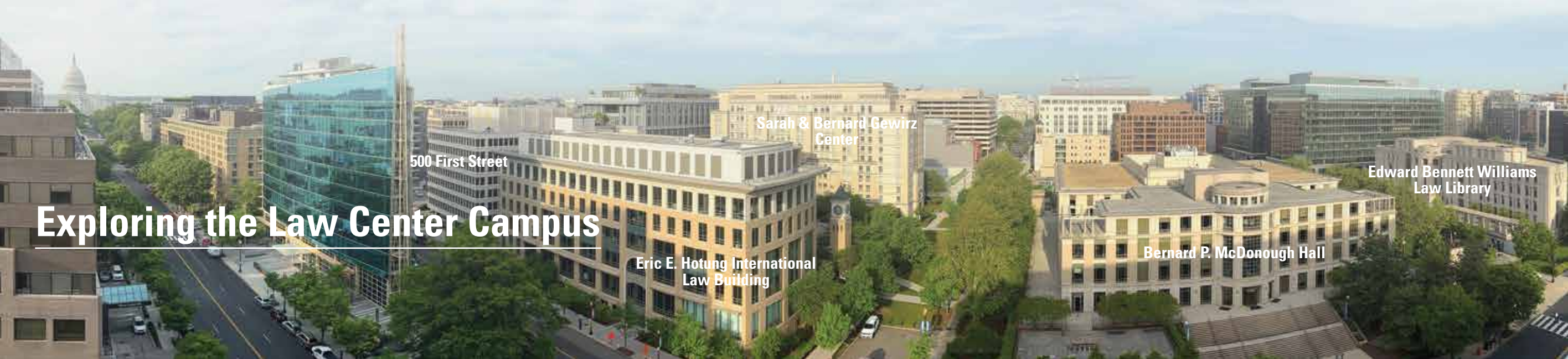
500 First Street

Transportation: Frequent shuttle services enable Georgetown University ID holders to travel between campuses and around the Capitol. Visit https://transportation.georgetown.edu to view the routes and full schedules.