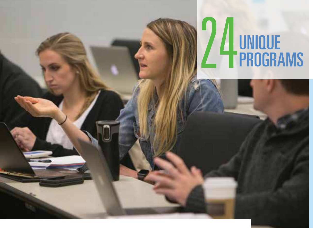
Taking Your Legal Career to the Next Level

Tradition. Innovation. A superb faculty. A curriculum unmatched in breadth and depth. The resources of a preeminent global university. And all of this just steps away from the Capitol and Supreme Court. As a graduate student at Georgetown, you study law in the place where U.S. laws are made.