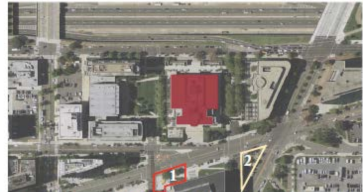
McDonough 1 Primary Assembly Area 2 Secondary Assembly Area

Number of Exits: 3 Doors Lock: Yes Furniture for Barricades: No